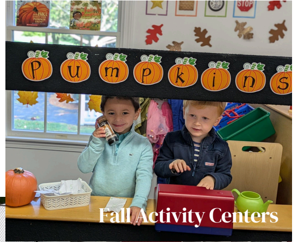
Fall Activity Centers