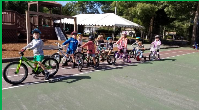
Biking is a Fair Acres favorite!

The children are given the opportunity to visit our goats Luna and Lola!!