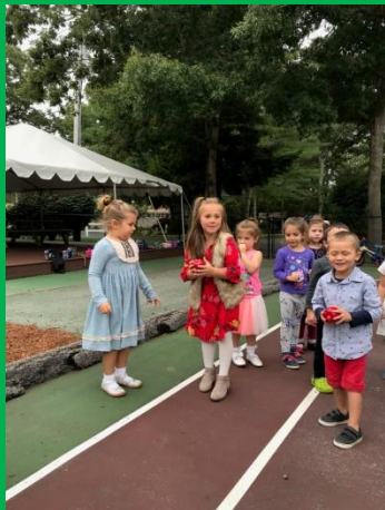
Children work on their gross motor skills by using our track for a variety of activities. Some of the activities include relay races and bike riding.