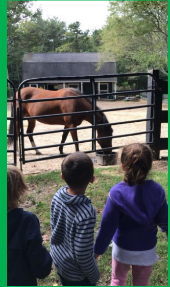
Amigo the horse enjoys when the children come and visit and bring special treats.