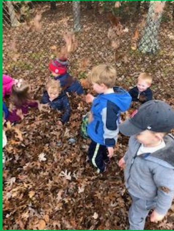
Our younger 3 classroom enjoyed jumping in the leaves.

We believe at Fair Acres that outdoor time plays an integral part in a child's overall development. When children have the opportunity to play and explore their outside environment their cognitive skills are increased leading to more learning in the classroom. The children are given the chance to explore the Fair Acre's campus every day.