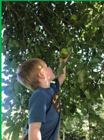
The children have the opportunity to pick apples right outside their classrooms.