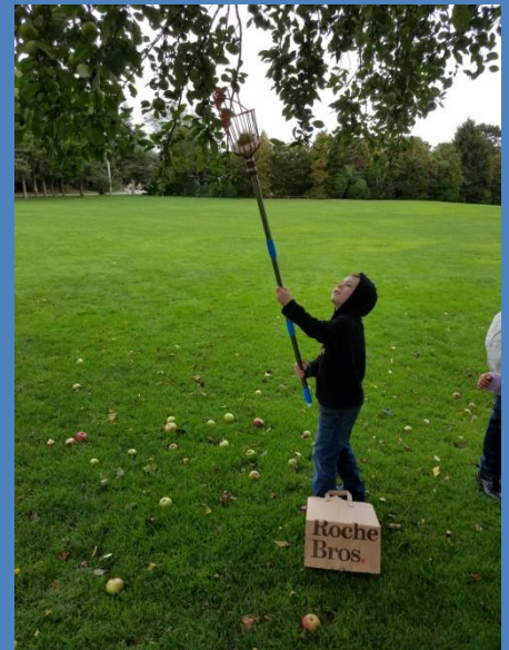
The children enjoy apple picking on the Fair Acres Campus.